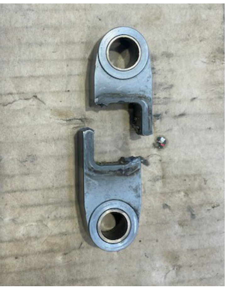
Figure 2 – Failed load cell link.