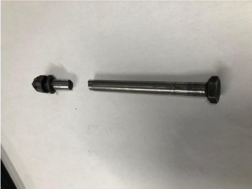
Pic 2: Sheared bolt