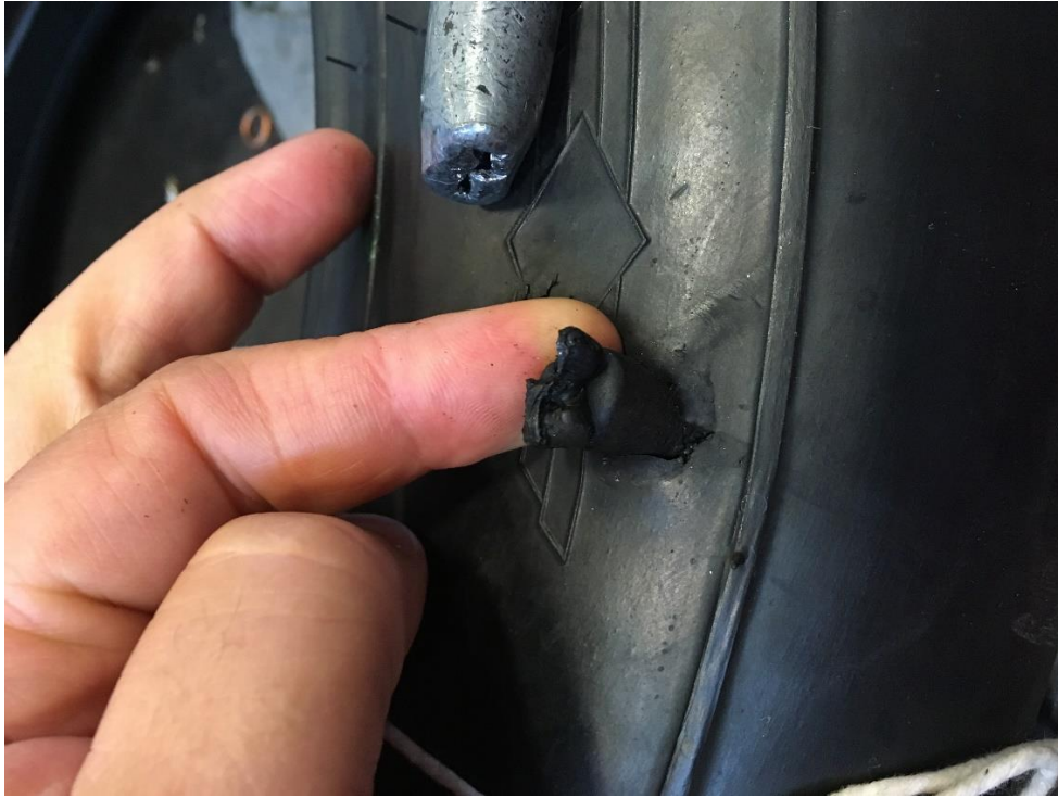
Fig 3: Indications metal was molded into tire