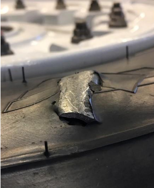
Fig 1: Metal showing after inflation close-up