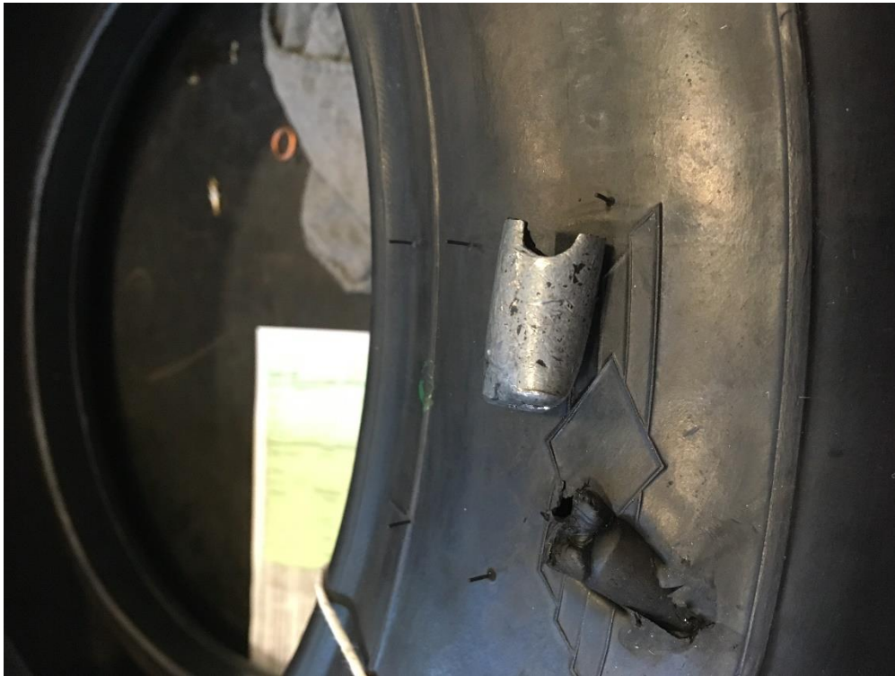
Fig 4: Metal removed