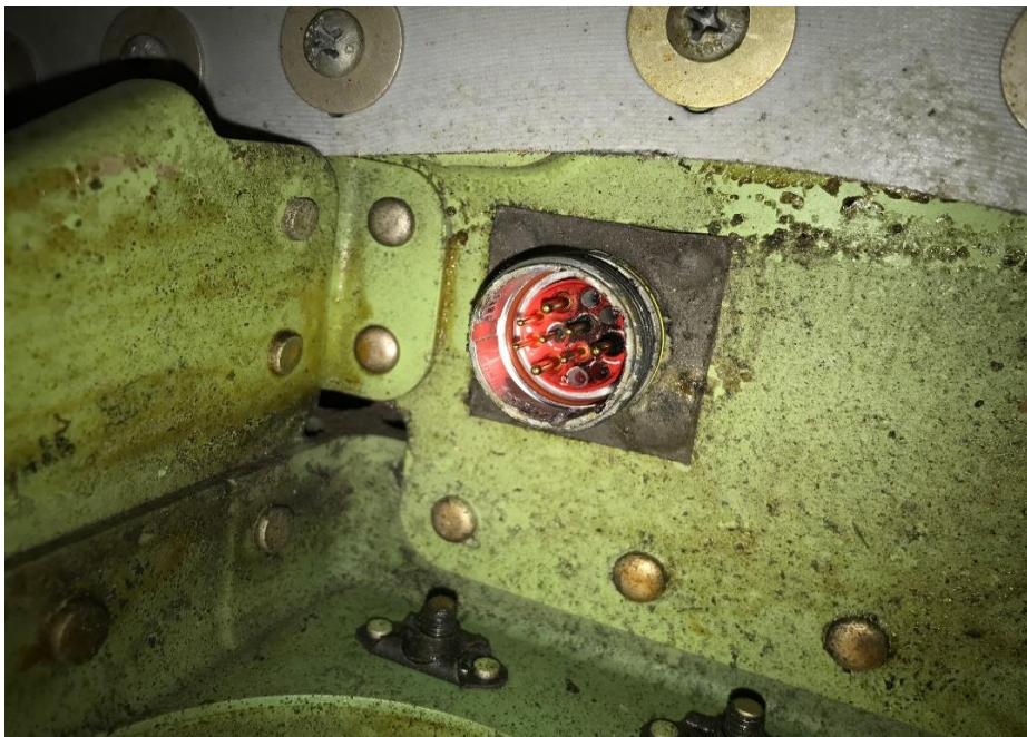
Pic 1: Evidence of arcing and soot on the connector pins

As maintenance personnel, additional consideration must also be given to the operating environments that may cause early buildup of corrosion. Electrical connectors and receptacles often hide the defect until the unit arcs and creates a fault. Please follow your aircraft's corrosion prevention and control program for appropriate methods to avoid such a snag.