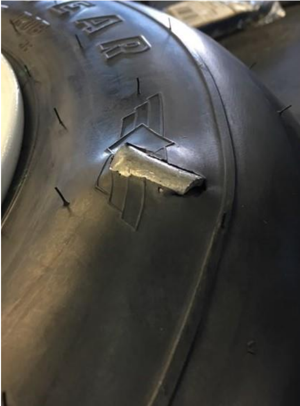
Fig 2: Metal Protruding