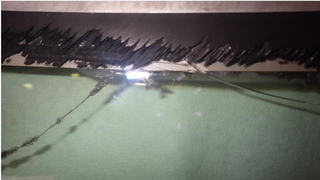
Figure 3. Close-up of foggy area and eroded sealant.