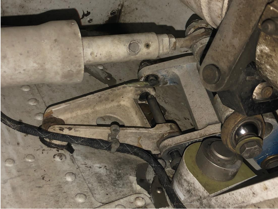
Pic 1: Sheared bolt in assembly