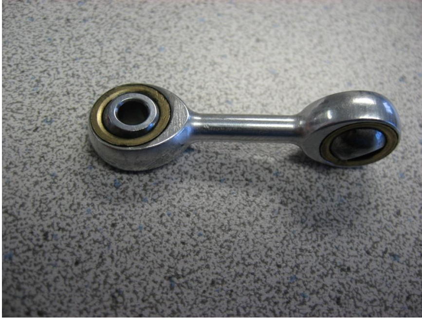
Figure 1: Pre R44 SB-71 throttle link P/N B564-2 having aluminum-bronze bearing races.