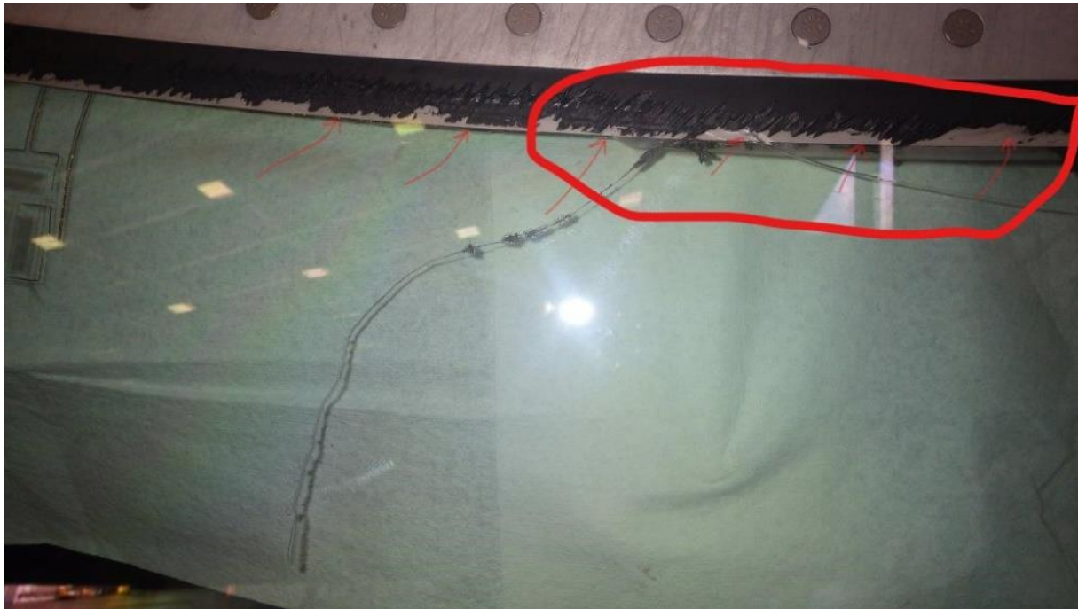
Figure 1. Window crack and red circle showing the foggy area of water ingress. Arrows show the worn away sealant that allowed the water to get in.

Maintaining the integrity of the window sealing should prolong the life of these cockpit windows by preventing ingress of moisture.