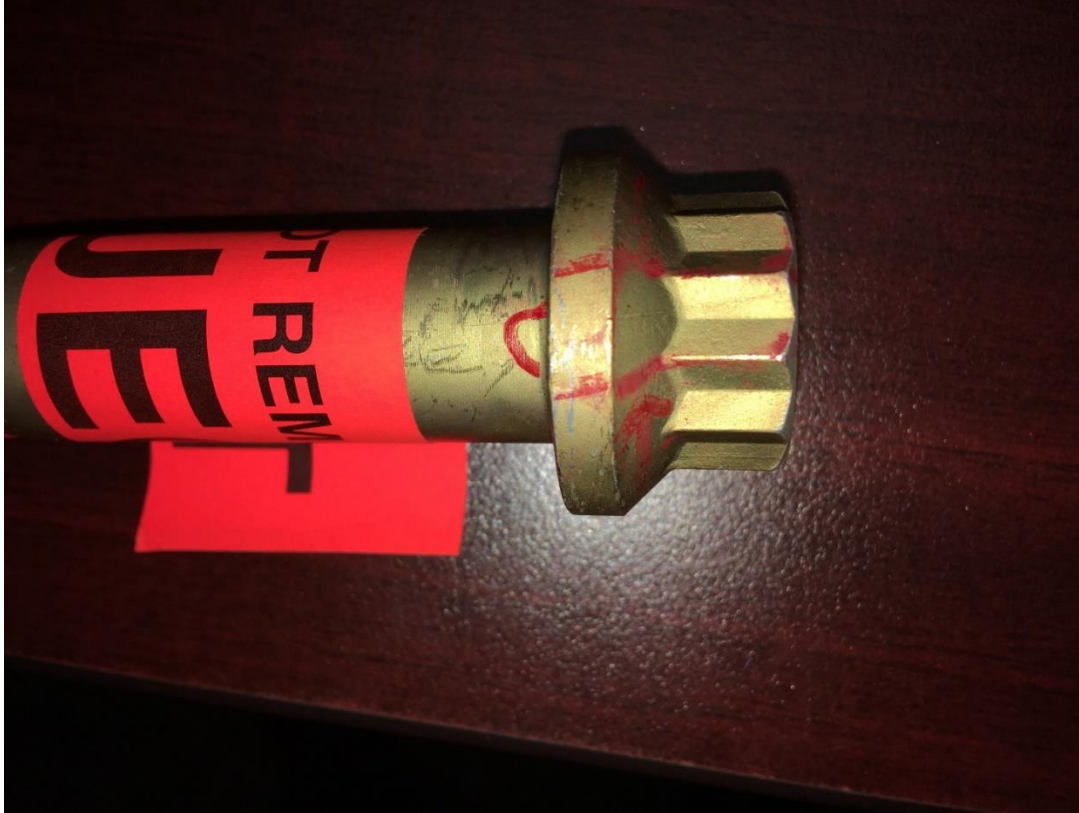
Figure 1. MS21250-12032 bolt showing area where crack was found