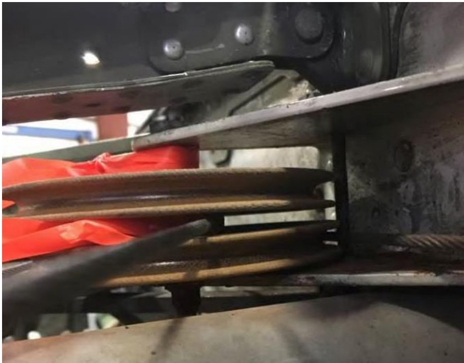
Aileron cable riding between two pulleys

A cable that has jumped of the pulley could cause the flight control to deflect from the neutral position and give the first indication that something is wrong. If the cable tension is low, inspect the whole control circuit and determine what is causing the cable tension to drop. It is very easy to miss that the cable has jumped off the pulley and it could cause a flight control jam in the most severe case.