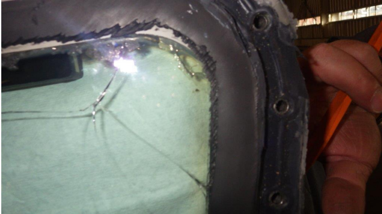
Figure 2. Cracking near terminal block and sealant eroded.