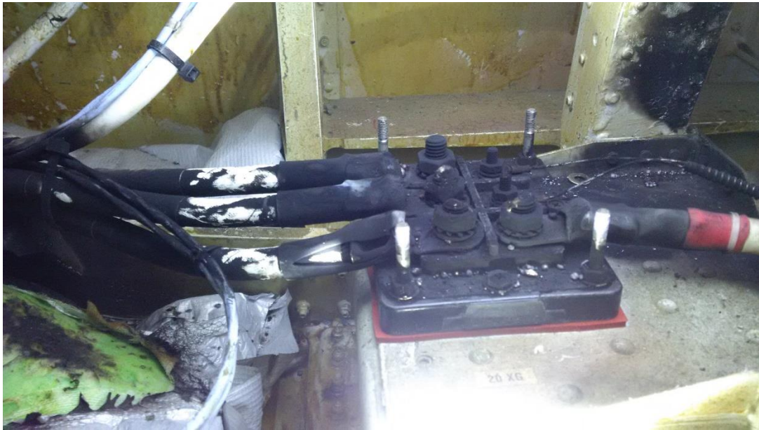
Pic 1: Evidence of fire. Soot present on wiring and structure.

The operator of this aircraft was fortunate that the fire had extinguished itself and had not caused more extensive damage to other components. The crew was also fortunate that an emergency landing was not conducted. To confirm wear and tear of the external power receptacle, Airbus recommends performing the GO-NOGO test, Aircraft Maintenance Manual (AMM) Task 24-41-00-220-801-A on an interval of 36 months/8000 Flight Cycles.