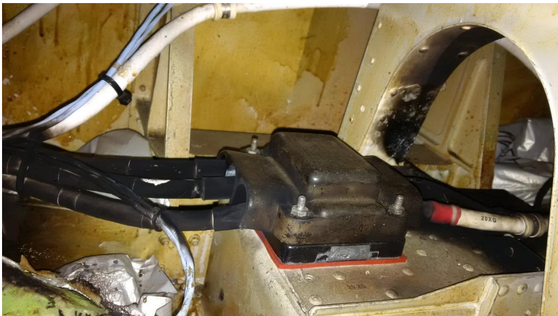
Pic 2: Shared receptacle cover.