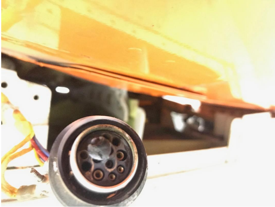
Pic 2: Melted receptacle