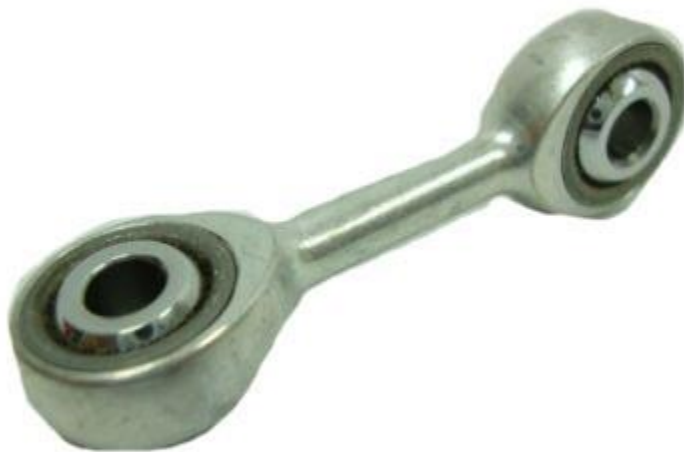
Figure 2: Post R44 SB-71 throttle link P/N B564-2 having Teflon™-lined steel bearing races.