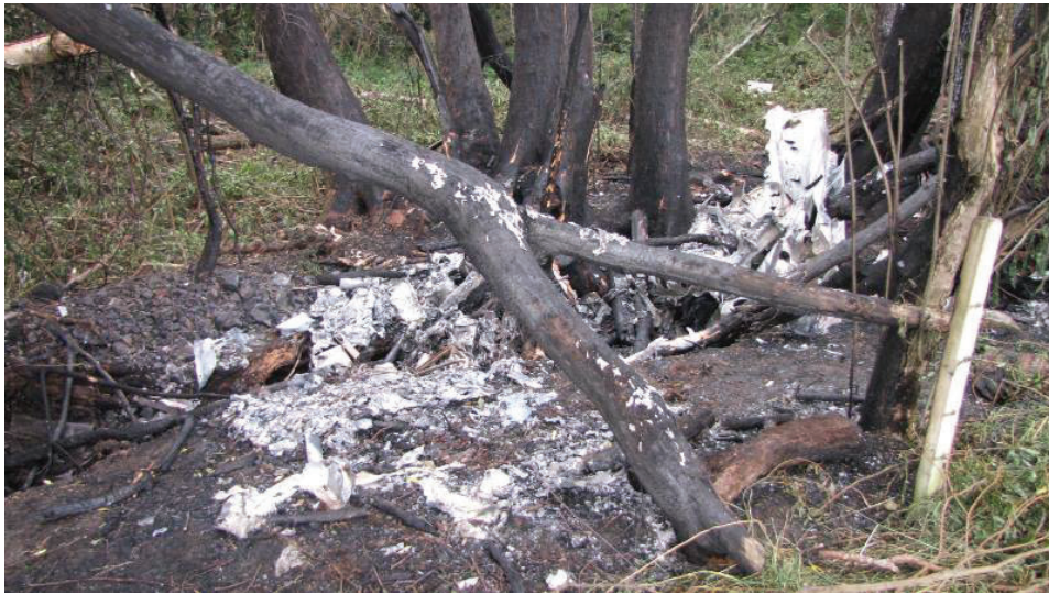
Figure 1: Accident site