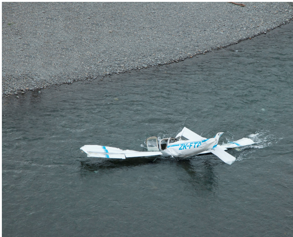
Figure 2: Accident Site