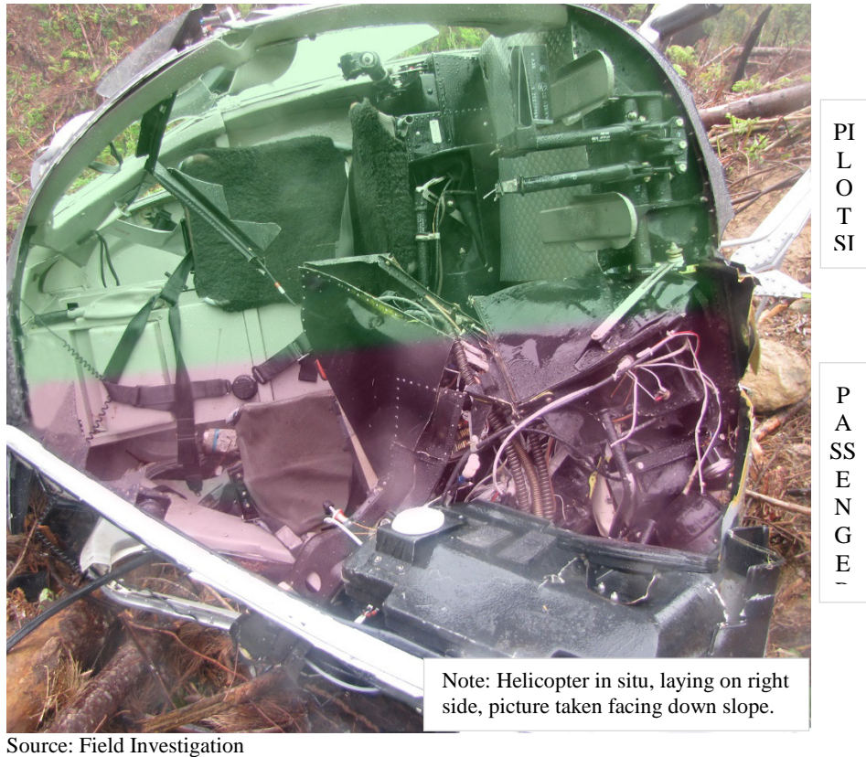
Figure 3: Front View of ZK-HQP Showing Pilot and Passenger Occupiable Space.

the right side of the helicopter fuselage and cockpit area sustained extensive damage, see Figure 3.