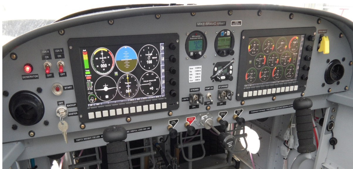
Figure 3: ZK-MBX Instrument Panel

The pilot/owner constructed the aircraft from a kit set. It was issued with a non-terminating Flight Permit in March 2014, in accordance with CAA Rule Part 103 – Microlight Aircraft –