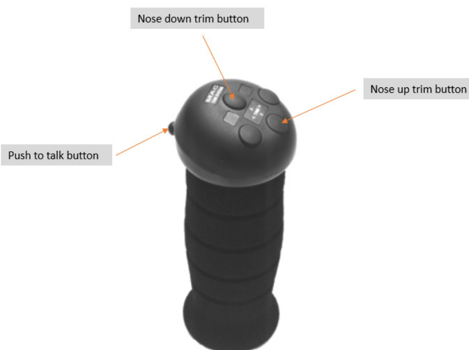
Figure 4: Ray Allen G205 Stick Grip, as installed on ZK-MBX (Manufacture).

During the safety investigation it was noted that the push button switches, by design, are sensitive and susceptible to inadvertent activation. They only required a light touch to activate the trim.