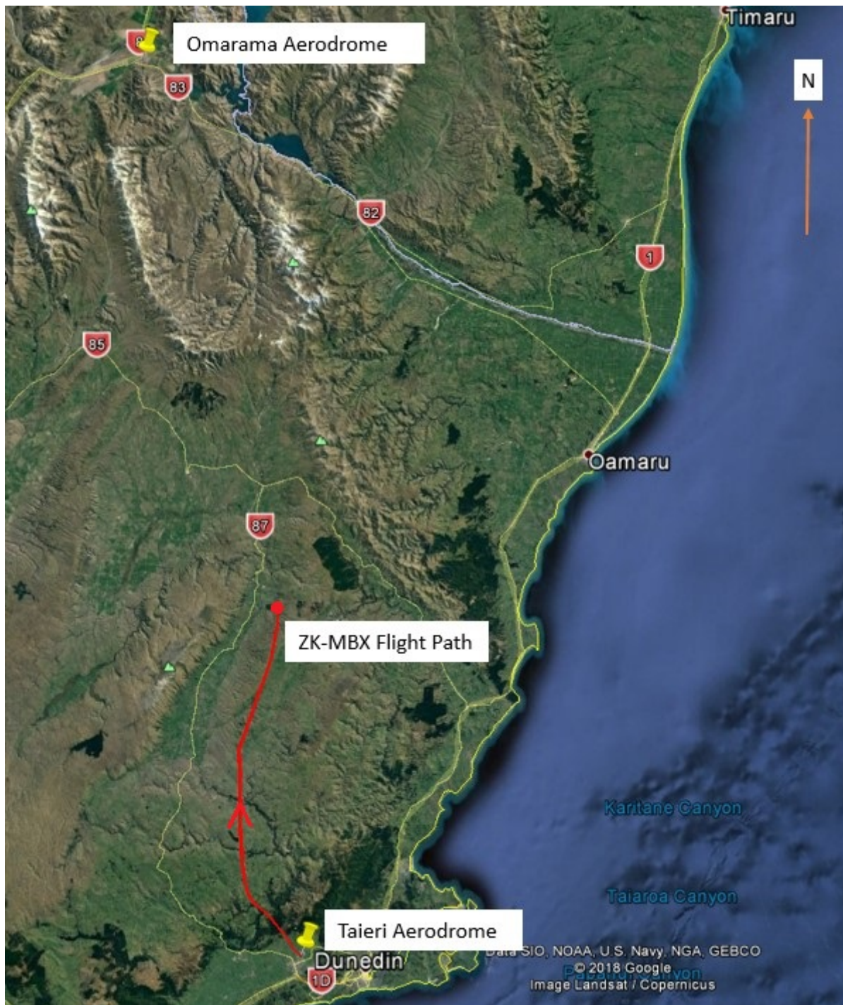
Figure 1: Map of flight path (Google Earth)