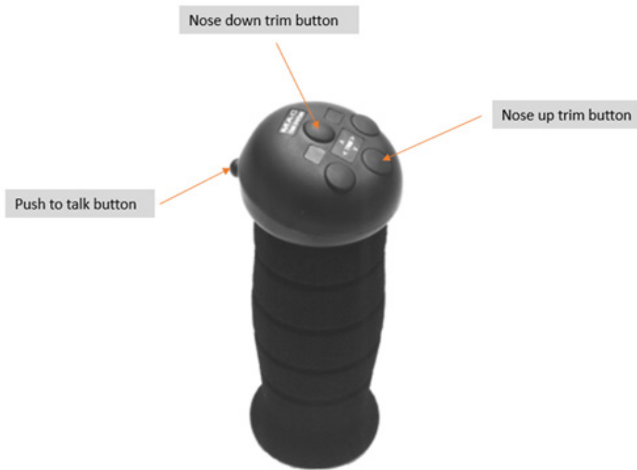
The Ray Allen Company, G205 Stick Grip