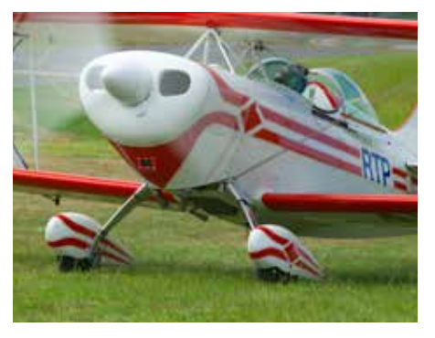
Example of an amateur-built aeroplane, a Pitts S-1 Special.

Amateur-built aircraft have, as the name suggests, been built by their owners for their own education and recreation. To be categorised this way, however, the owner must have constructed at least 51 percent of the aircraft ('the 51% rule'). They complete a flight evaluation process under the experimental category, then have a new airworthiness certificate issued in the amateur-built category.