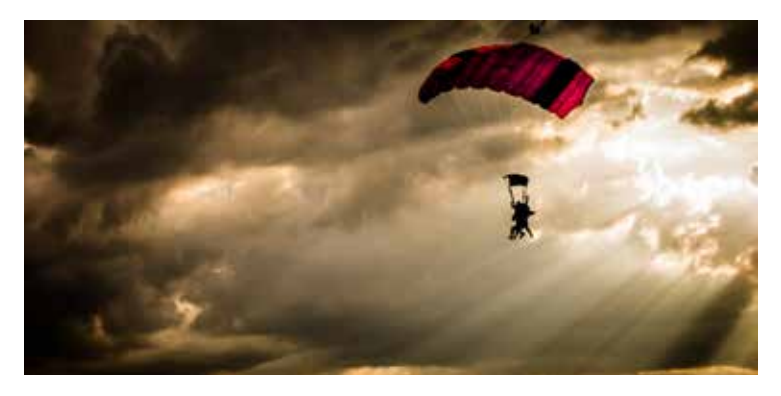
Someone wanting to fly a parachute needs a pilot certificate issued by a Part 149 aviation recreation organisation.

There are technical standards for parachutes and requirements to be a parachute technician. These are administered by the aviation recreation organisation certificated under Part 149 for the purpose. For more information, see Part 105.