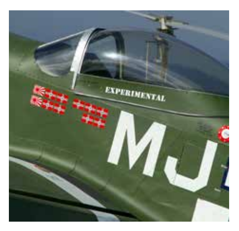
This Titan Mustang would have undergone test flying under the experimental category, and once that testing was complete, would have a new airworthiness certificate issued under the amateur-built category.

Let's look at the other four categories in more detail.