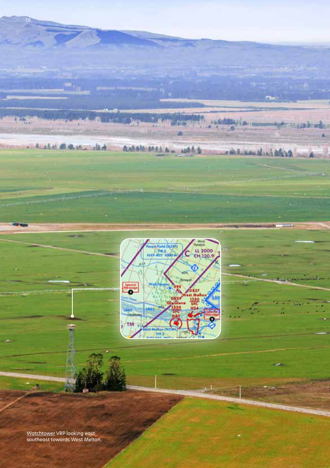
Watchtower VRP looking east southeast towards West Melton.