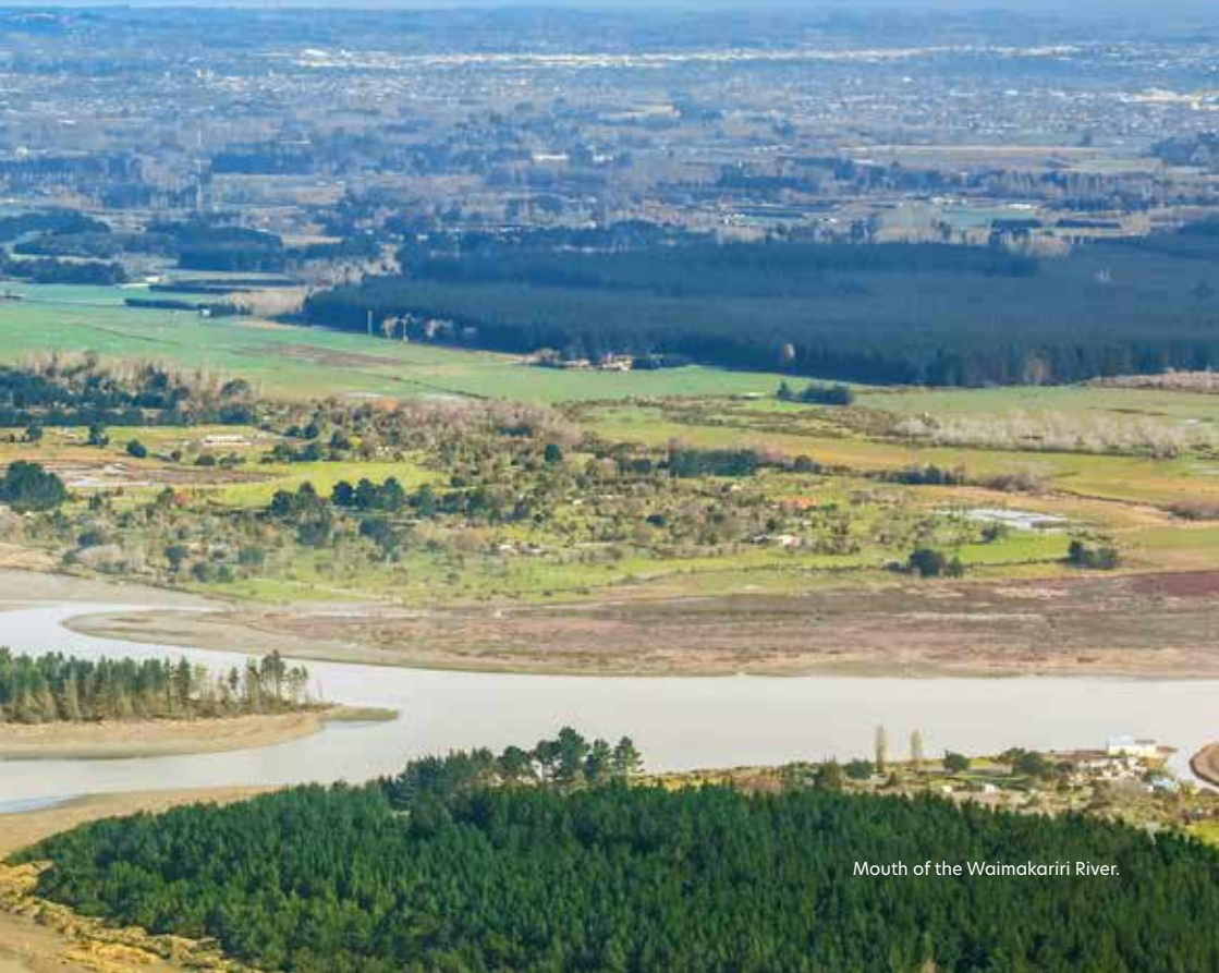
Mouth of the Waimakariri River.

You could count them off, but local instructors will tell students to identify three different land features on the ground – say, the river, a bridge and a power line. Then confirm that on your chart.