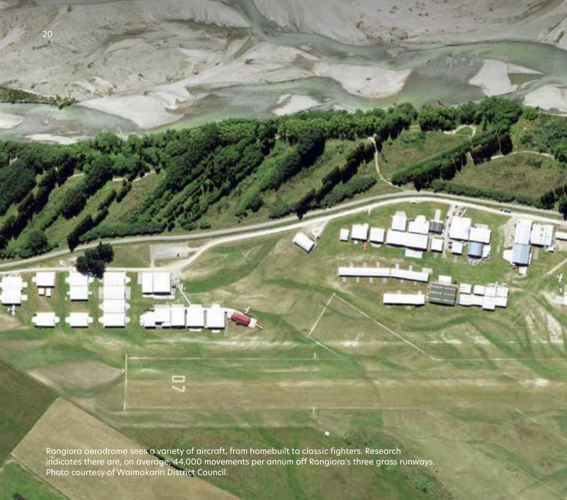
Rangiora aerodrome sees a variety of aircraft, from homebuilt to classic fighters. Research indicates there are, on average, 44,000 movements per annum off Rangiora's three grass runways.