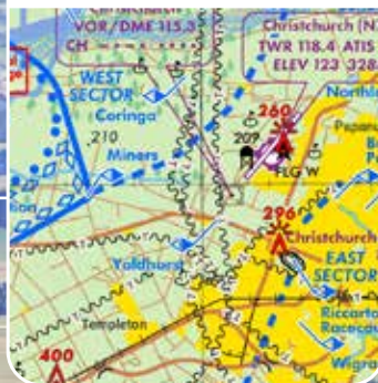
Large gravel pit that is Miners VRP

Rangiora can be extremely busy airspace. There are around 44,000 movements per annum off Rangiora's three grass runways. These movements are made up of general aviation, microlight, and helicopter operations, including training.