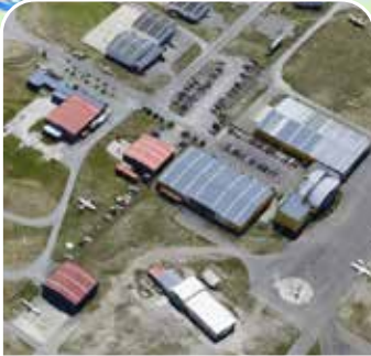
Helicentre (operated by Christchurch Helicopters)