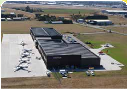
The southern site of the GCH Aviation facility looking north, with the main (02/20) runway out of frame on the left. Runway 29/11 and the rest of the airport campus is in the background.