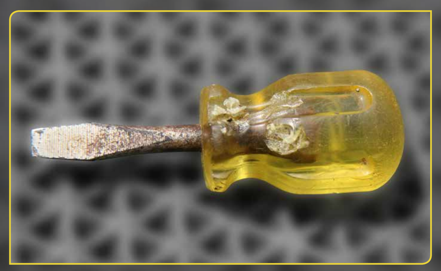
Safety investigators looking into a fatal crash in 2012 concluded that this screwdriver had remained in the rear-most section of the fuselage for some time.

"Make sure you take away all your own equipment, possessions and litter. Don't rely on the next pilot to check." ■