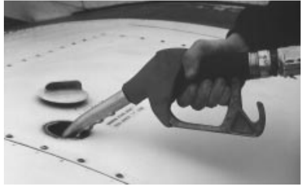
Fuel pump hose diameter, nozzle diameter, and fuel transfer speed, all affect the rate at which static is generated while refuelling.

Hot refuelling is a term for a refuelling operation that takes place with the engine burning and the blades turning. This operation is mainly confined to helicopters, but it can also apply to some fixed-wing aircraft. In either case, the machine is made of conducting and non-conducting materials, and a static charge is building up while everything is rotating. This situation creates a very efficient self-generating 'charging machine' for want of a better term. The dissipation of the resulting charges that build up is to earth – if that is possible. If the aircraft is insulated