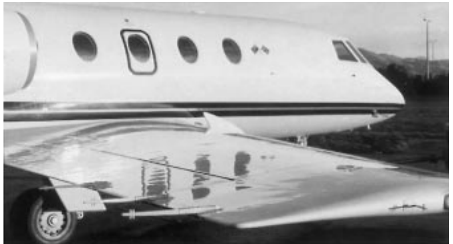
Static dischargers fitted to the trailing edge surfaces of some aircraft help to reduce static potential.

Ground and atmospheric conditions affect