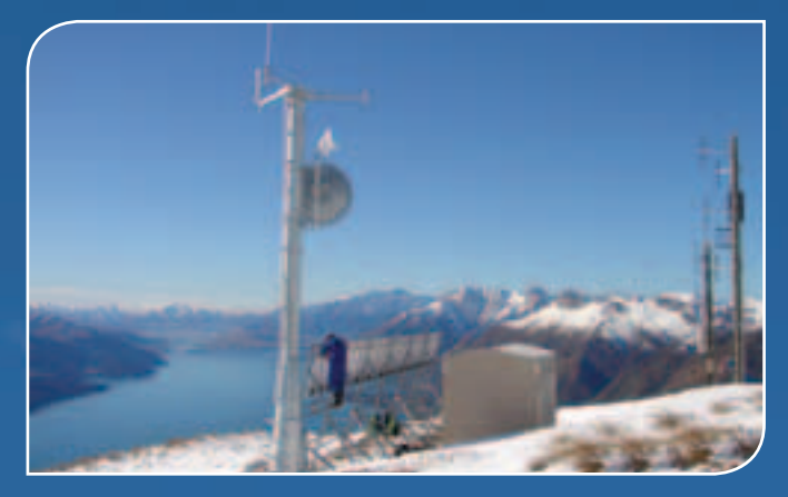
A technician installs a solar panel to the Mount Nicholas MLAT sensor at Queenstown.