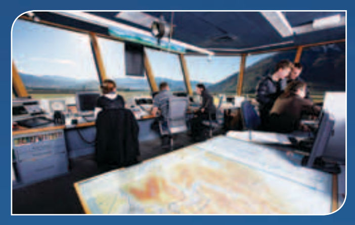
Controllers on duty in the Queenstown tower.

Learn more: See Vector Sep/Oct 2008 for more on how the MLAT technology works, available on the CAA web site under "Publications". ■