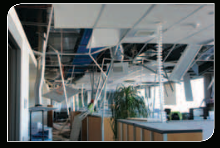
Damage sustained by Christchurch International Airport Limited's offices.