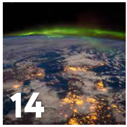
// SPACE WEATHER

Cover: See the article "Safety in heli ops" on page 4