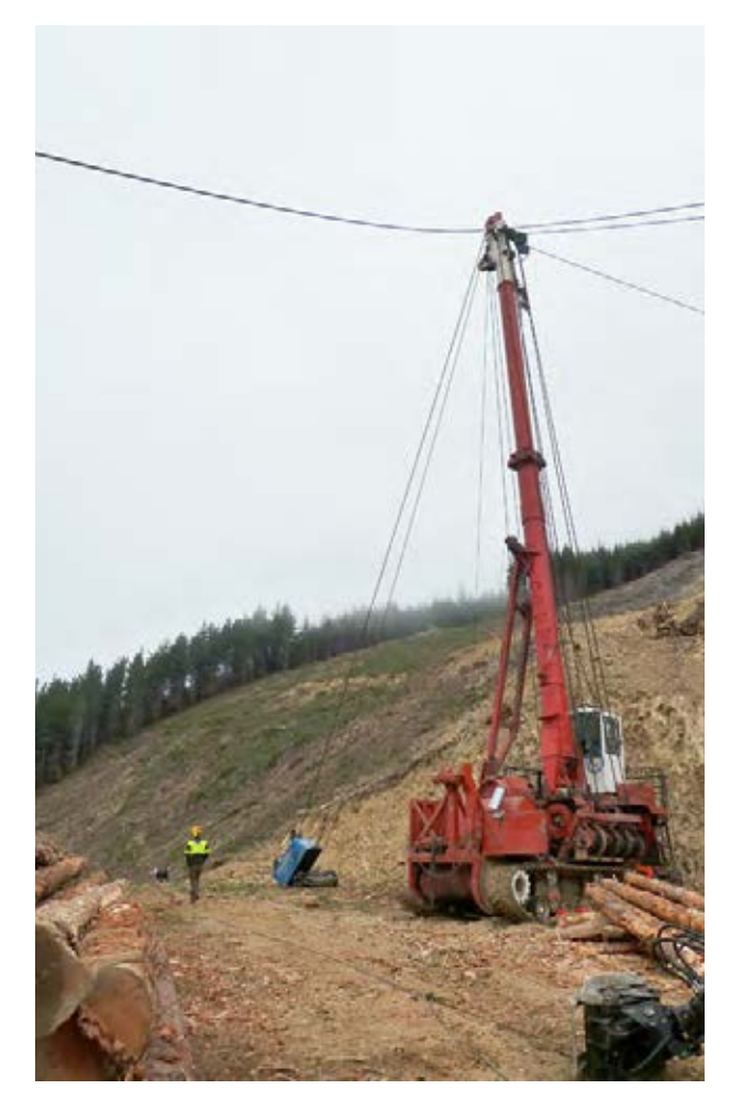
IP Pilots should keep a keen lookout, even if there are no NOTAMs out for their planned route.

"There'll be more low level hazards, like cable systems, in forests that operators might have been flying over – hazard-free – for years." \cong