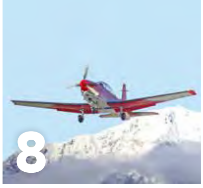
// FLYING NEAR MOUNT STUPID

Cover: See the article "Safety in heli ops" on page 4, istockphoto.com/atm2003