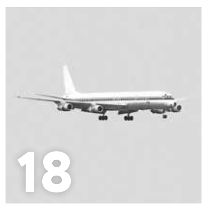
// STAYING STAUNCH IN THE STORM