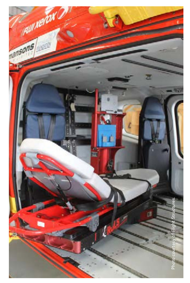
// This Flight Structures system in the new Auckland Rescue Helicopter Trust AW 169 has the stretcher in the transverse position for loading the patient, but then swivelling to the longitudinal position for flight. That allows the medical team substantially more room to work on the patient, including stabilising them during flight, rather than on the ground. That could save up to 30 minutes in delivery to the hospital.

If you're interested in participating, email tim.dutton@ caa.govt.nz. The dates and locations of the workshops will be decided based on the interest received.