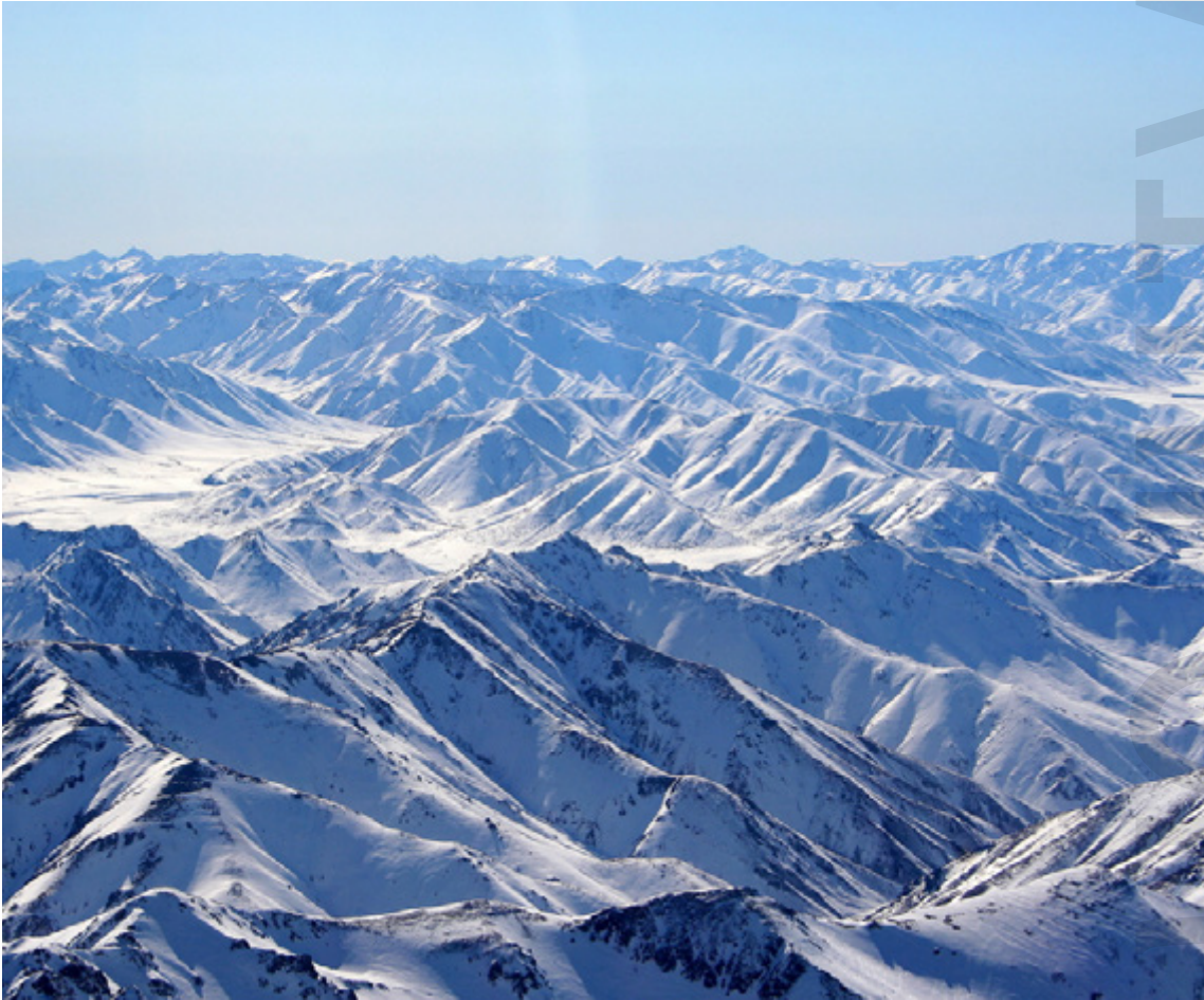
Photo of the Kalkoura Ranges, taken during the visits small airports throughout the country.