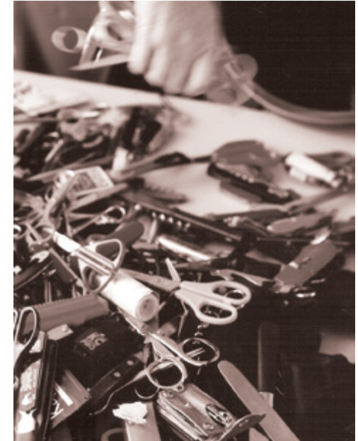
2001 | A table full of items relinquished by passengers in the weeks after 9/11.