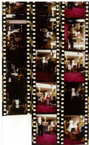
Film strip of new x-ray machines.