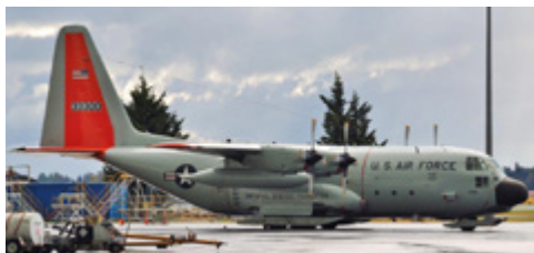
A US Air Force LC130 Hercules prepares to leave Christchurch for Antarctica.

Not surprisingly a challenge in providing the USAP service is the weather which plays a big part in scheduling. Staff including a dog handler can be rostered on, and then at the last minute, the flight is delayed or cancelled. On the other side of the coin, a re-scheduled flight, which needs to be security screened, can be arranged on very short notice.