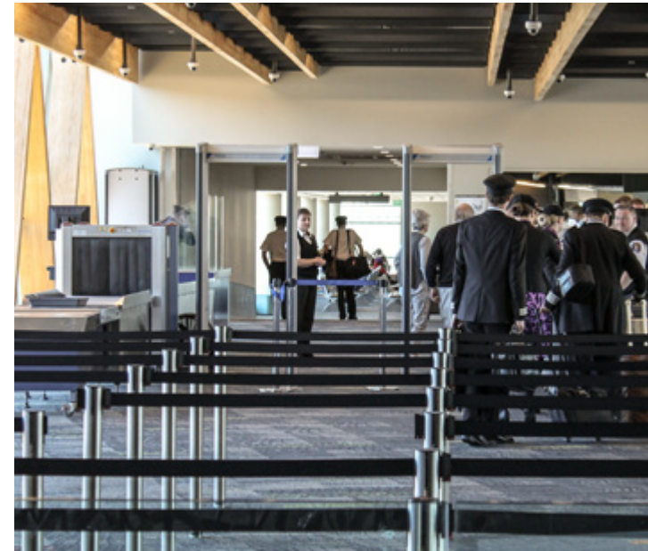
Departures gate, Wellington Airport.