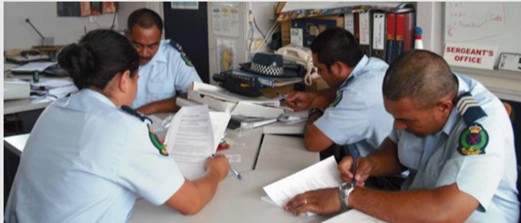
A training course conducted by Avsec on Niue.

Apart from operational training – for example what to look for on an x-ray screen – Avsec provides on-going support and advice on technical and personal development training to implement succession planning and identify future leaders.