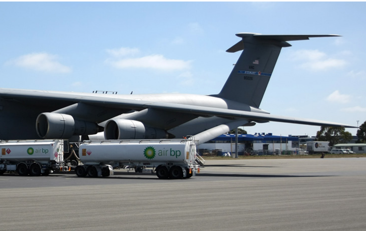
One of the US Air Force's giant C5 Galaxy aircraft, used for Antarctic missions, on the tarmac at Christchurch.

In 2016 for the first time ever, aircraft flew to Antarctica in winter. Starting in April, the sun completely disappears for four months, but now night-vision technology means winter flights are possible. The trial season was a success, but it wasn't without a 'ground hog' element. The August flight was delayed for three days before eventually taking off after the weather finally cleared. Tala said "Those rolling delays are probably one of the biggest hurdles we face doing this work. Sometimes we end up screening the same passengers over and over because of flight delays – frustrating for both us and passengers".