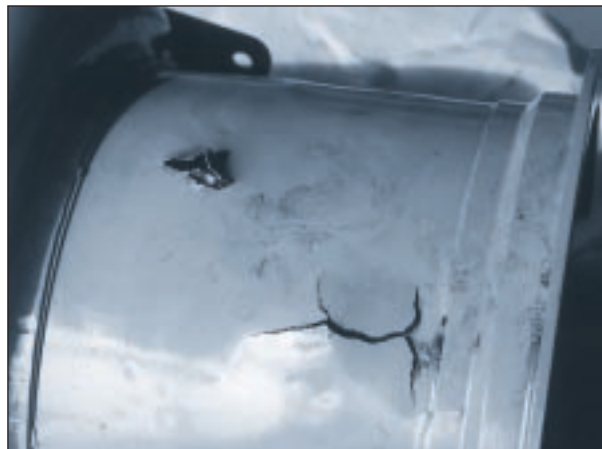
The outer case assembly of the compressor on the New Zealand aircraft, showing damage caused by the separation of one blade at takeoff power.

Extex, who manufacture components for the Allison engines, make their compressor wheel from Custom 450, a purer speciality