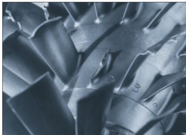
The second and third stage compressor wheel assembly from an Allison 250-C20B turbine that recently failed on a New Zealand aircraft. Note how the blade has failed at its base and the resulting damage to the blades behind as it passed rearwards.

of a small pit, hardly visible to the naked eye. It is from this pit that a fatigue fracture can propagate.