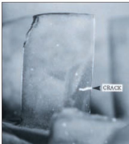
An archive photo showing a blade from a different compressor failure. It reveals a crack indication in the number two blade, possibly caused by pitting corrosion.

Even taking this statement with a grain of salt (no pun intended), it is worth taking into account the possibility of a compressor blade failure caused by saline corrosion — especially when we include